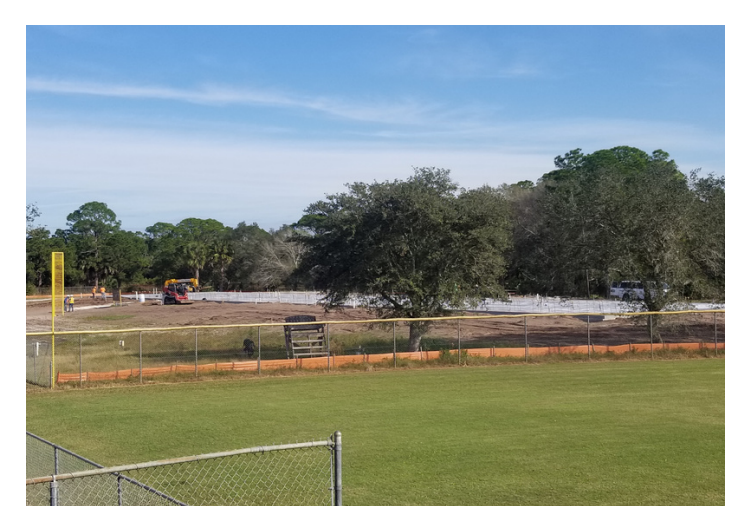
The concrete pad was poured this past week for the new CTE building as phase 1 of the new Okeechobee High School is progressing.

The first phase of the new Okeechobee High School reached a milestone this past week as concrete for the new building was poured. The roof and the walls will be the part of the structure, which should take place in the next few weeks. The new CTE building will house Automotive, Construction, JROTC, and the planned Outboard new and Marine Technology program. Once complete and equipment and classrooms are relocated, the demolition of the "old" CTE building will take place as the new high school will utilize that space. Exciting changes are occurring!